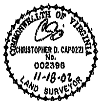
EXHIBIT "A" CLAIBORNE (A CONDOMINIUM COMMUNITY) PHASE EIGHT CITY OF WILLIAMSBURG, VIRGINIA