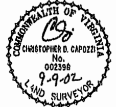
EXHIBIT "A" PHASE 25 FAIRWAYS VILLAS AT GREENSPRINGS, A CONDOMINIUM FOR GREENSPRINGS DEVELOPMENT, L.C. BERKELEY DISTRICT JAMES CITY COUNTY, VIRGINIA