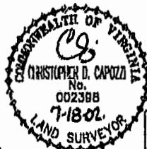
EXHIBIT "A" CLAIBORNE (A CONDOMINIUM COMMUNITY) PHASE TWO

NOTE: ARCHITECTURAL PLANS PREPARED BY BEN ADDERHOLDT - ARCHITECT.