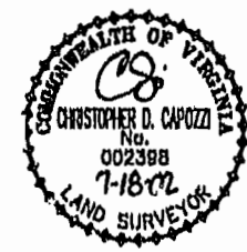
EXHIBIT "A" CLAIBORNE (A CONDOMINIUM COMMUNITY) PHASE TWO

NOTE: ALL DIMENSIONS ARE FROM FACE OF STUDS UNLESS NOTED OTHERWISE.