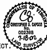
EXHIBIT "A" CLAIBORNE (A CONDOMINIUM COMMUNITY) PHASE TWO CITY OF WILLIAMSBURG, VIRGINIA

City of Williamsburg & County of James City Circuit Court: This PLAT was recorded on 22 July 2002 at 10:29 AM PM-PB Pla. PG 22-701 DOCUMENT # 021288 BETSY B. WOOLRIDGE, CLERK Betsy Woolridge Dep. Clerk