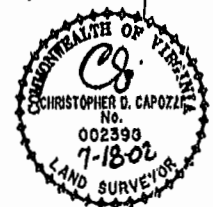
EXHIBIT "A" CLAIBORNE (A CONDOMINIUM COMMUNITY) PHASE TWO