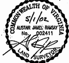
EXHIBIT OF PROPOSED PARKING GARAGE BUILDING LOCATION AND RESUBDIVISION PLAT SCALE: 1" = 30' DATE: 8-21-01

SURVEYOR'S CERTIFICATE I HEREBY CERTIFY THAT TO THE BEST OF MY KNOWLEDGE AND BELIEF, THIS PLAT COMPLIES WITH ALL OF THE REQUIREMENTS OF THE APPLICABLE CODES AND REGULATIONS OF THE CITY OF WILLIAMSBURG, VIRGINIA, REGARDING THE PLATING OF SUBDIVISIONS WITHIN THE CITY HAVE BEEN COMPLIED WITH. DATE: 5/1/02 ALISTAIR J. RAMSAY L.S.