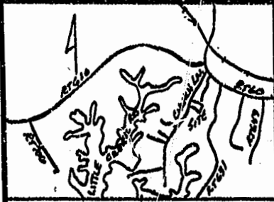
VICINITY MAP 1"=2000'