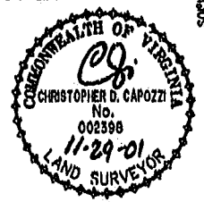
EXHIBIT "A" PHASE 34 FAIRWAYS VILLAS AT GREENSPRINGS, A CONDOMINIUM FOR GREENSPRINGS DEVELOPMENT, L.C.