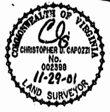
EXHIBIT "A" PHASE 34 FAIRWAYS VILLAS AT GREENSPRINGS, A CONDOMINIUM FOR GREENSPRINGS DEVELOPMENT, L.C. BERKELEY DISTRICT JAMES CITY COUNTY, VIRGINIA