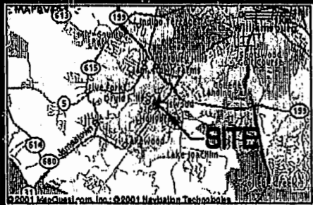
VICINITY MAP (NTS)