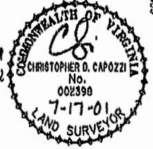
EXHIBIT "A" PHASE 27 FAIRWAYS VILLAS AT GREENSPRINGS, A CONDOMINIUM FOR GREENSPRINGS DEVELOPMENT, L.C. BERKELEY DISTRICT JAMES CITY COUNTY, VIRGINIA

SEE SHEETS 4 FOR LOCATION AND DETAILS OF PHASE 22, BLDG. #43