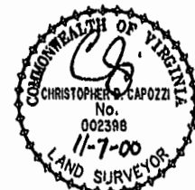
EXHIBIT "A" PHASE 14 FAIRWAYS VILLAS AT GREENSPRINGS, A CONDOMINIUM FOR GREENSPRINGS DEVELOPMENT, L.C.

COMMON AREA BMP LAKE #1 AREA = 38,052 SQ. FT. = 0.8735 AC. SEE SHEET 3 FOR DETAIL