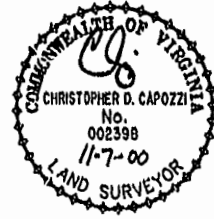
EXHIBIT "A" PHASE 14 FAIRWAYS VILLAS AT GREENSPRINGS, A CONDOMINIUM FOR GREENSPRINGS DEVELOPMENT, L.C. BERKELEY DISTRICT JAMES CITY COUNTY, VIRGINIA