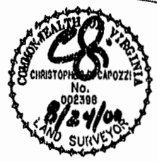
EXHIBIT "A" PHASE 13 FAIRWAYS VILLAS AT GREENSPRINGS, A CONDOMINIUM FOR GREENSPRINGS DEVELOPMENT, L.C. BERKELEY DISTRICT JAMES CITY COUNTY, VIRGINIA