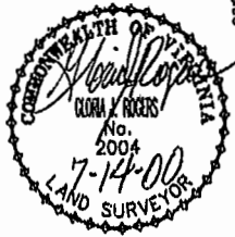
EXHIBIT "A" PHASE 23 FAIRWAYS VILLAS AT GREENSPRINGS, A CONDOMINIUM FOR GREENSPRINGS DEVELOPMENT, L.C. BERKELEY DISTRICT JAMES CITY COUNTY, VIRGINIA

SEE SHEETS 4 FOR LOCATION AND DETAILS OF PHASE 22, BLDG. #43