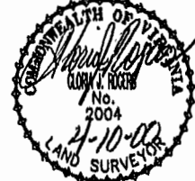
EXHIBIT "A" PHASE 22 FAIRWAYS VILLAS AT GREENSPRINGS, A CONDOMINIUM FOR GREENSPRINGS DEVELOPMENT, L.C. BERKELEY DISTRICT JAMES CITY COUNTY, VIRGINIA

COMMON AREA BMP LAKE #1 AREA = 38,052 SQ. FT. = 0.8735 AC. SEE SHEET 3 FOR DETAIL