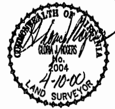
EXHIBIT "A" PHASE 22 FAIRWAYS VILLAS AT GREENSPRINGS, A CONDOMINIUM FOR GREENSPRINGS DEVELOPMENT, L.C. BERKELEY DISTRICT JAMES CITY COUNTY, VIRGINIA

Winchester/James City County 2:14 p.m. Recorded 19th day of April 2000 DOCUMENT # 0000 2267 Betty Suberling