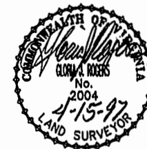
EXHIBIT # 1 PHASE TWO LAFONTAINE CONDOMINIUMS AT WILLIAMSBURG CROSSING PHASE TWO FOR