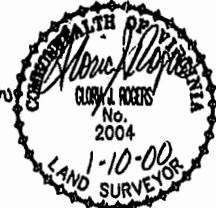
EXHIBIT "A" PHASE 20 FAIRWAYS VILLAS AT GREENSPRINGS, A CONDOMINIUM FOR GREENSPRINGS DEVELOPMENT, L.C. BERKELEY DISTRICT JAMES CITY COUNTY, VIRGINIA