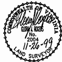
EXHIBIT "A" PHASE 39 FAIRWAYS VILLAS AT GREENSPRINGS, A CONDOMINIUM FOR GREENSPRINGS DEVELOPMENT, L.C.

Recorded 30 day of November 1999 DOCUMENT # 990025005-2-57 [Signature] Clerk