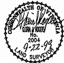
EXHIBIT "A" PHASE 38 FAIRWAYS VILLAS AT GREENSPRINGS, A CONDOMINIUM FOR GREENSPRINGS DEVELOPMENT, L.C. BERKELEY DISTRICT JAMES CITY COUNTY, VIRGINIA