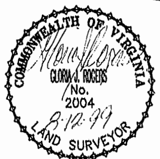
EXHIBIT "A" PHASE 10 FAIRWAYS VILLAS AT GREEN SPRINGS, A CONDOMINIUM FOR GREEN SPRINGS DEVELOPMENT, L.C. BERKELEY DISTRICT JAMES CITY COUNTY, VIRGINIA