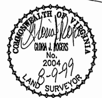
EXHIBIT "A" PHASE 37 FAIRWAYS VILLAS AT GREEN SPRINGS, A CONDOMINIUM FOR GREEN SPRINGS DEVELOPMENT, L.C. BERKELEY DISTRICT JAMES CITY COUNTY, VIRGINIA

Recorded 16 day of August 1999 DOCUMENT # 990017399 10:31