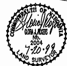
EXHIBIT "A" PHASE 42 FAIRWAYS VILLAS AT GREENSPRINGS, A CONDOMINIUM FOR GREENSPRINGS DEVELOPMENT, L.C. BERKELEY DISTRICT JAMES CITY COUNTY, VIRGINIA