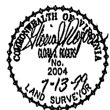
EXHIBIT "A" PHASE 9 FAIRWAYS VILLAS AT GREEN SPRINGS, A CONDOMINIUM FOR GREEN SPRINGS DEVELOPMENT, L.C. BERKELEY DISTRICT JAMES CITY COUNTY, VIRGINIA