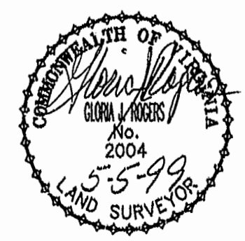
EXHIBIT "A" PHASE 43 FAIRWAYS VILLAS AT GREEN SPRINGS, A CONDOMINIUM FOR GREEN SPRINGS DEVELOPMENT, L.C. BERKELEY DISTRICT JAMES CITY COUNTY, VIRGINIA

PLAT RECORDED IN P.B. NO. 13, PAGE 28-35