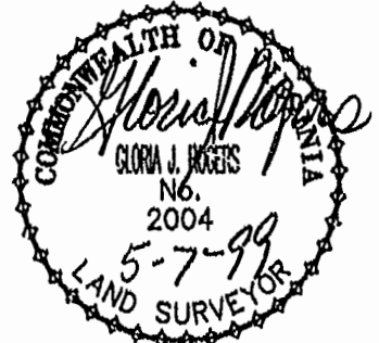
EXHIBIT "A" PHASE 8 FAIRWAYS VILLAS AT GREEN SPRINGS, A CONDOMINIUM FOR GREEN SPRINGS DEVELOPMENT, L.C.

PLAT RECORDED IN P.B. NO. 72, PAGE 22-28