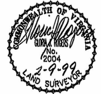
EXHIBIT "A" PHASE 31 FAIRWAYS VILLAS AT GREEN SPRINGS, A CONDOMINIUM FOR GREEN SPRINGS DEVELOPMENT, L.C. BERKELEY DISTRICT JAMES CITY COUNTY, VIRGINIA