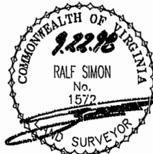
EXHIBIT # 1 PHASE SIXTEEN LAFONTAINE CONDOMINIUMS AT WILLIAMSBURG CROSSING PHASE SIXTEEN

FOR UNIVERSITY SQUARE ASSOCIATES JAMESTOWN DISTRICT JAMES CITY COUNTY, VIRGINIA