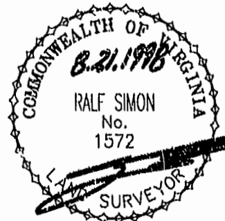
EXHIBIT # 1 PHASE FOURTEEN LAFONTAINE CONDOMINIUMS AT WILLIAMSBURG CROSSING PHASE FOURTEEN FOR UNIVERSITY SQUARE ASSOCIATES JAMESTOWN DISTRICT JAMES CITY COUNTY, VIRGINIA

11:48 AM Recorded 26 days after 1558 DOCUMENT # 980216198 By [Signature]