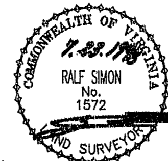
EXHIBIT "A" PHASE 4 FAIRWAYS VILLAS AT GREEN SPRINGS, A CONDOMINIUM FOR GREEN SPRINGS DEVELOPMENT, L.C. BERKELEY DISTRICT JAMES CITY COUNTY, VIRGINIA