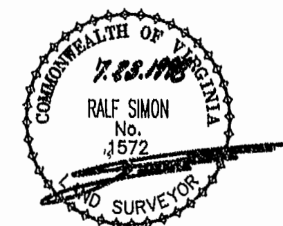
EXHIBIT "A" PHASE 4 FAIRWAYS VILLAS AT GREEN SPRINGS, A CONDOMINIUM FOR GREEN SPRINGS DEVELOPMENT, L.C. BERKELEY DISTRICT JAMES CITY COUNTY, VIRGINIA