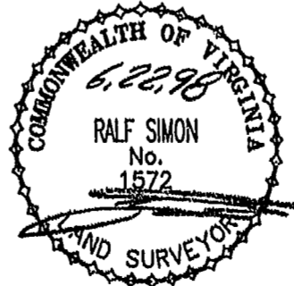
EXHIBIT "A" PHASE 3 FAIRWAYS VILLAS AT GREEN SPRINGS, A CONDOMINIUM FOR GREEN SPRINGS DEVELOPMENT, L.C. BERKELEY DISTRICT JAMES CITY COUNTY, VIRGINIA