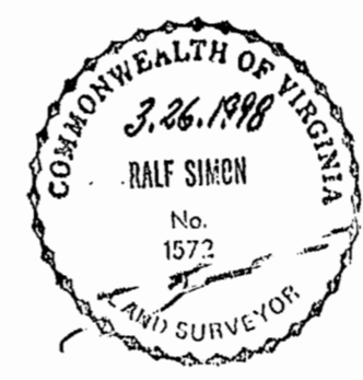
EXHIBIT "C" PHASE 1 FAIRWAYS VILLAS AT GREEN SPRINGS, A CONDOMINIUM FOR GREEN SPRINGS DEVELOPMENT, L.C. BERKELEY DISTRICT JAMES CITY COUNTY, VIRGINIA

PLAT RECORDED IN P.B. NO. 68 FROM 95-109