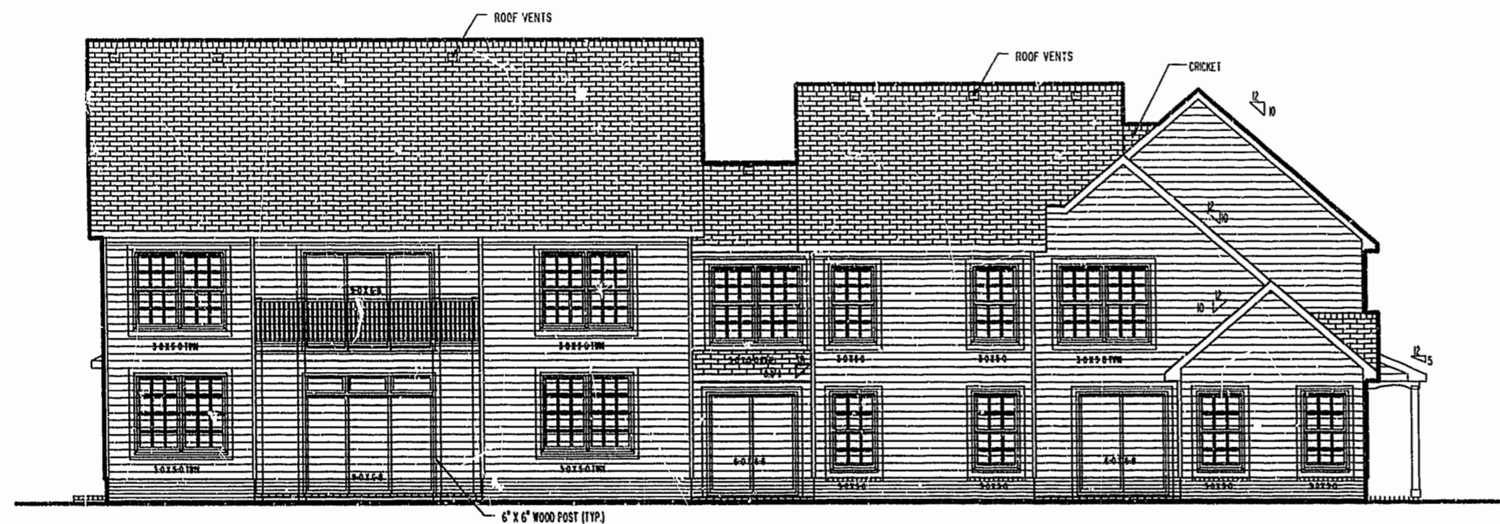
REAR ELEVATION MODEL 400 SCALE: 1/8" = 1'-0"