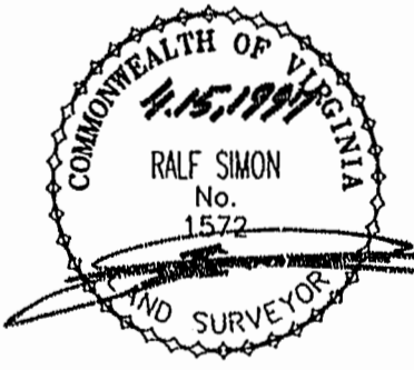
EXHIBIT # 1 PHASE TWO LAFONTAINE CONDOMINIUMS AT WILLIAMSBURG CROSSING PHASE TWO FOR UNIVERSITY SQUARE ASSOCIATES JAMESTOWN DISTRICT JAMES CITY COUNTY, VIRGINIA