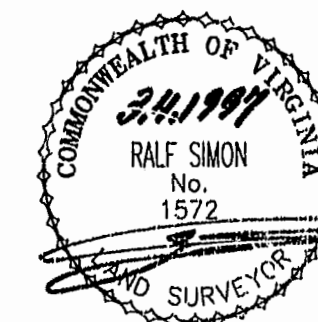
EXHIBIT # 1 PHASE FIVE LAFONTAINE CONDOMINIUMS AT WILLIAMSBURG CROSSING PHASE FIVE

FOR WILLIAMSBURG SQUARE ASSOCIATES JAMESTOWN DISTRICT JAMES CITY COUNTY, VIRGINIA