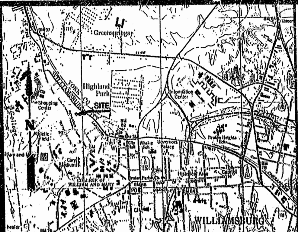
VICINITY MAP 1" = 2000'

N/F C.C. CASEY & SONS DB. 60/317 PB. 25/52