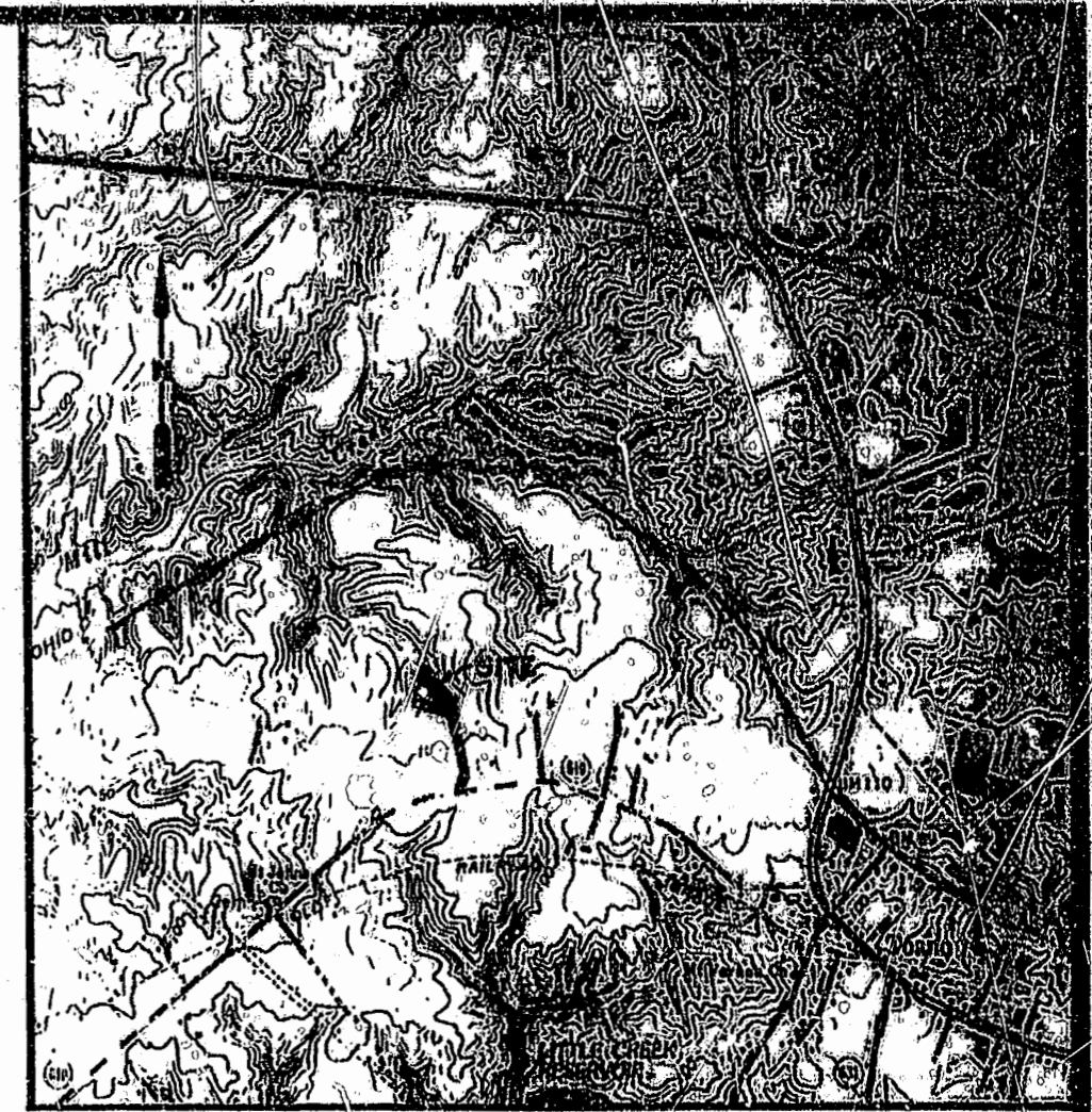
LOCATION MAP SCALE: 1" = 2000'

3:50p.m. Recorded 30 day of Jan 19 95 D.B. No. 722 pages 488 [Signature] Clerk