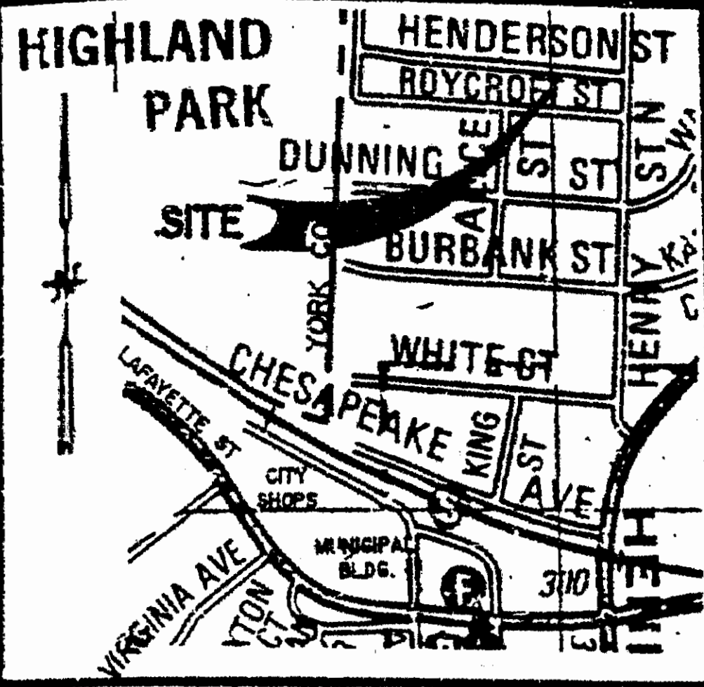
LOCATION MAP 1" = 2000'