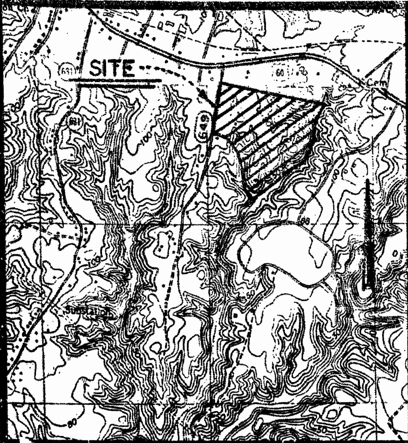
VICINITY MAP SCALE: 1"=2000'