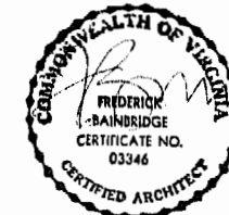
EXHIBIT B CONFERENCE CENTER CONDOMINIUM PHASE 2A BEING A SUBDIVISION OF PROPERTY OF BUSCH PROPERTIES, INC. KINGSMILL ON THE JAMES JAMES CITY COUNTY, VIRGINIA SCALE: 1" = 8' DATE: 5/07/90 Langley and McDonald, P.C. VIRGINIA BEACH AND WILLIAMSBURG, VIRGINIA Bainbridge and Associates ARCHITECTS SHEET 13 OF 16