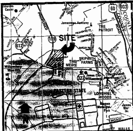
LOCATION MAP Scale: 1" = 2000'