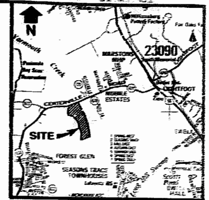
LOCATION MAP 1"=4000'