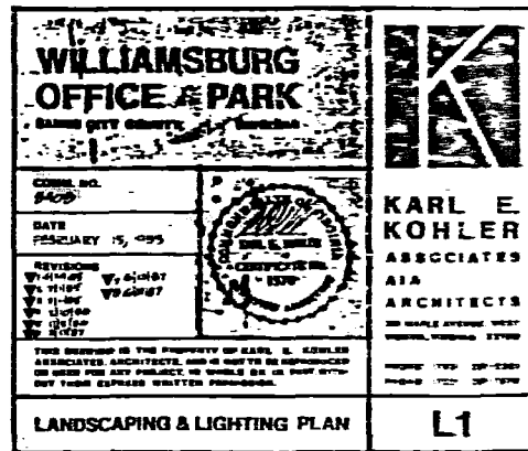
LANDSCAPING & LIGHTING PLAN SCALE: 1" = 30'-0"