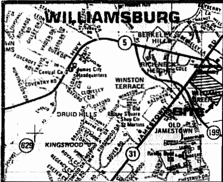
LOCATION MAP SCALE: 1"=2000'

APPROVED: CITY OF WILLIAMSBURG BY Paul C. Small PLAT APPROVING AGENT DATE 7-27-86 STATE OF VIRGINIA CITY OF WILLIAMSBURG IN THE CLERK'S OFFICE OF THE CIRCUIT COURT FOR THE CITY OF WILLIAMSBURG THIS 25 DAY OF Sept. 19 86 THIS MAP WAS PRESENTED AND ADMITTED TO RECORD AS THE LAW DIRECTS PLAT BOOK 43 , PAGE 63 . TESTE Helene S. Ward CLERK BY _____