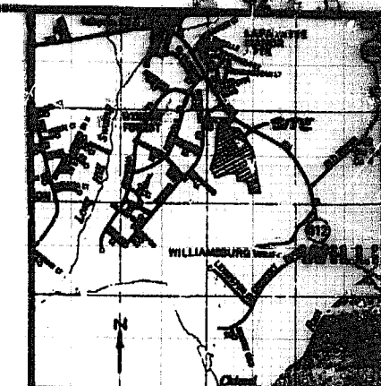
LOCATION MAP SCALE: 1"=2000'

BUILDING RESTRICTIONS PROPERTY IS ZONED RESIDENTIAL, LIMITED DISTRICT R-1 LOTS ARE SERVED BY PUBLIC WATER AND SEWER SETBACK REQUIREMENTS FRONT: 35' MINIMUM (30' MINIMUM BY DEVELOPER ON ALL LOTS EXCEPT LOTS 1, 2, 3, 4, 5, 6, 7, 8, 9, 10, 11, 12, 13, 14, 15, 16, 17, 18, 19, 20, 21, 22, 23, 24, 25, 26, 27) REAR: 35' MINIMUM, A TOTAL OF 23' SIDES: 15' MINIMUM, A TOTAL OF 23' NOTES: 15' SIDE SETBACKS FROM SPECIAL PROVISION FOR CORNER LOTS: OF THE TWO SIDES OF A CORNER LOT, THE FRONT SHALL BE DEEMED TO BE THE SHORTER OF THE TWO SIDES FRONTING ON STREETS. THE SIDE YARD SETBACK ON THE SIDE FACING THE SIDE STREET SHALL BE A MINIMUM OF 25' (25' MINIMUM BY DEVELOPER). FRONTAGE: 80' AT SETBACK FOR LOTS OF LESS THAN 20,000 SF; 100' AT SETBACK FOR LOTS OF 20,000 SF TO 43,500 SF; 150' AT SETBACK FOR LOTS OF MORE THAN 43,500 SF MINIMUM LOT SIZE: 12,000 SF FOR SUBDIVISIONS WITH PUBLIC WATER ALL UTILITIES TO BE PLACED UNDERGROUND