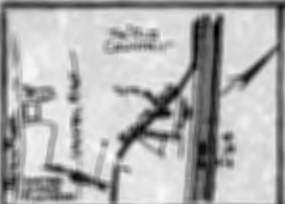
Location Map (to scale)