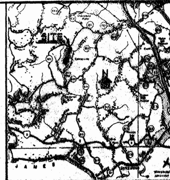
VICINITY MAP SCALE: 1"=2 MILES