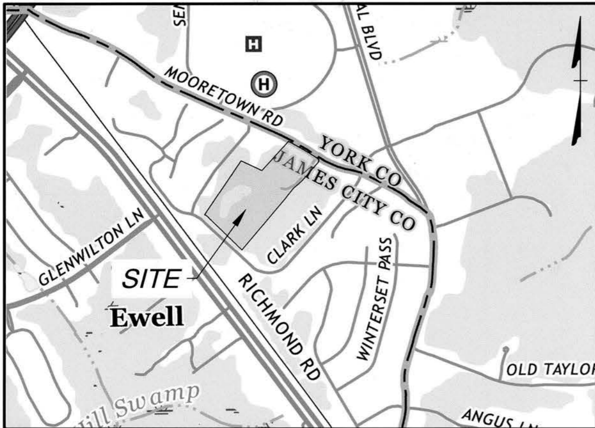
VICINITY MAP SCALE: 1" = 1000'